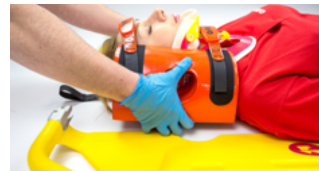
Figure 5 - Clamp the base for head