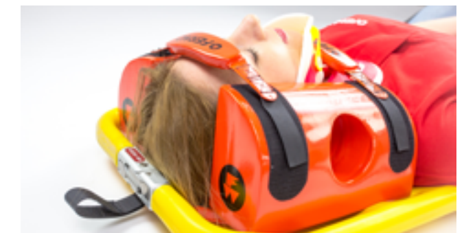
Figure 6 - Placing the patient on the scoop stretcher