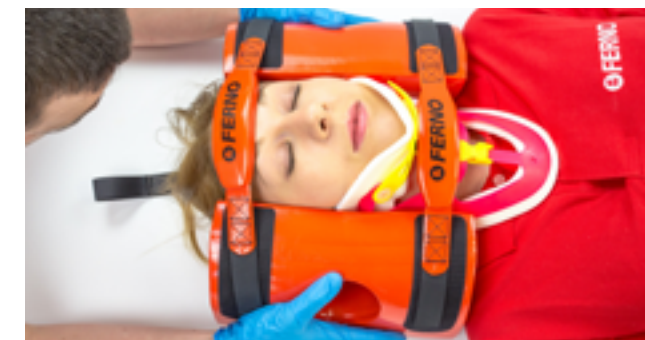
Figure 5 - Head immobilizer applied correctly