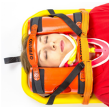
Figure 8 – Head immobilizer correctly applied with the "H" Velcro strap