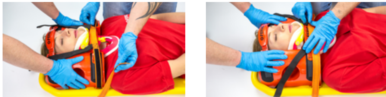
Figure 7 – Applying the "H" Velcro strap