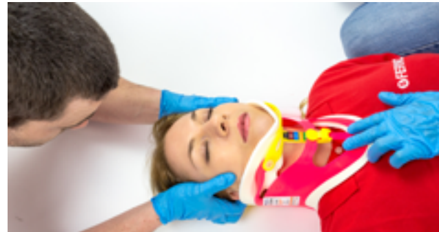
Figure 1 – Cervical Collar Applied

Before applying the head immobilizer, ensure that the cervical collar has been correctly applied on the patient (Figure 1). For use of the cervical collar, consult the relative user manual.