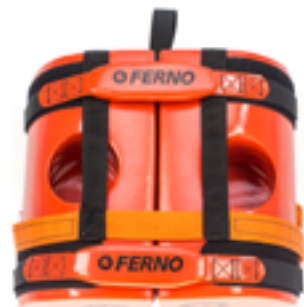
Figure 9 - Storage

The head immobilizer should be cleaned and stored in a dry place indoors, away from direct sunlight. It should be stored as shown when not in use (Figure 9).