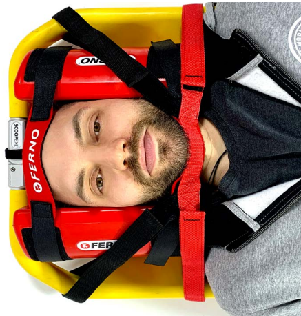
Figure 5 - Head immobiliser correctly applied with “H”-shaped Velcro strap