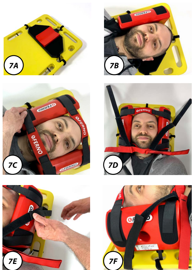
Figura 7 - B-lock application on spinal board

Ferno s.r.l. non risponde a danni causati ad utilizzatori o a terzi derivanti da un utilizzo non conforme del fermacapo B-lock.