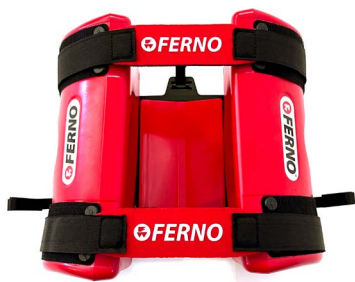
Figure 6 - Storage configuration

The head immobiliser must be stored clean, indoors, in a dry place and away from direct sunlight. When not in use, store it in the storage configuration (Figure 9).