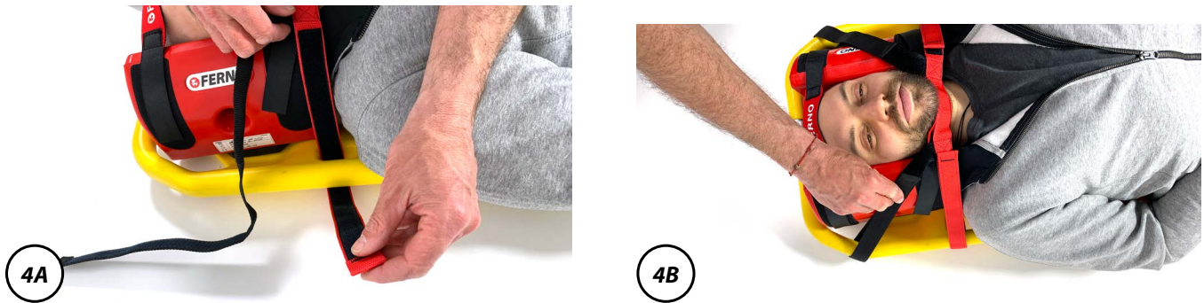
Figure 4 - “H”-shaped Velcro strap application